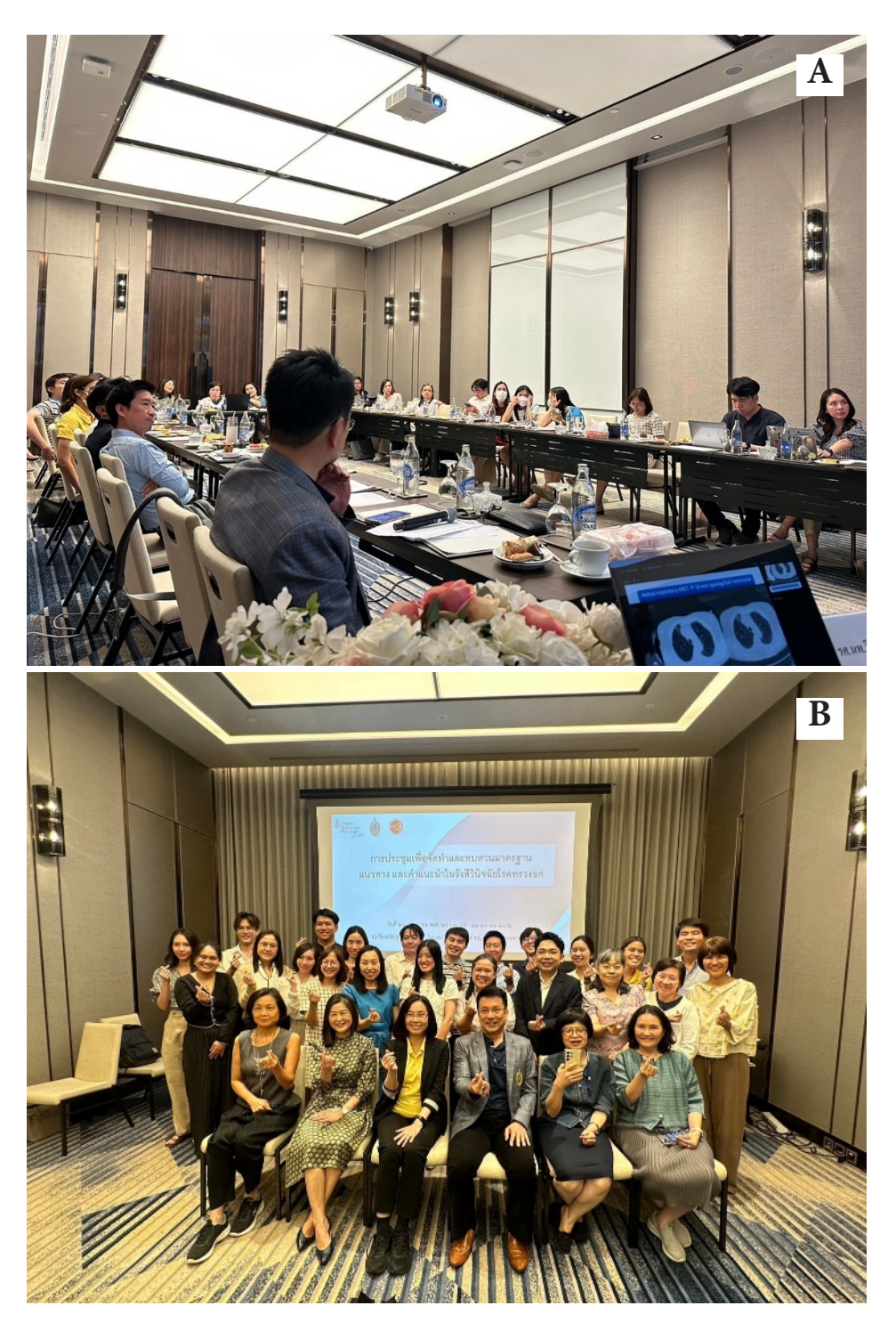
Figure 1. ( A ) Engaging atmosphere during the comprehensive meeting discussion ( B ) Group photo of the panel captured post-meeting.

THE ASEAN JOURNAL OF RADIOLOGY ISSN 2672-9393