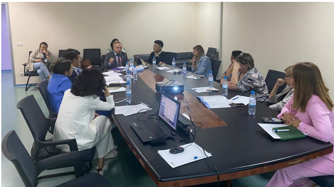
Figure 10. Regular meeting of the main specialists in radiology of the Health Ministry of the Republic of Kazakhstan, Astana/Kazakhstan (2023 year).

Every month Astana branch of RSK carries out a one-hour meeting on actual issues of diagnostic and interventional radiology, management in radiology. During the meeting, topical issues, rare clinical cases, plans of future conferences and congresses are discussed (Figure 10). Furthermore, leaders and members of our society conduct educational seminars and thematic master classes in different regions of Kazakhstan.