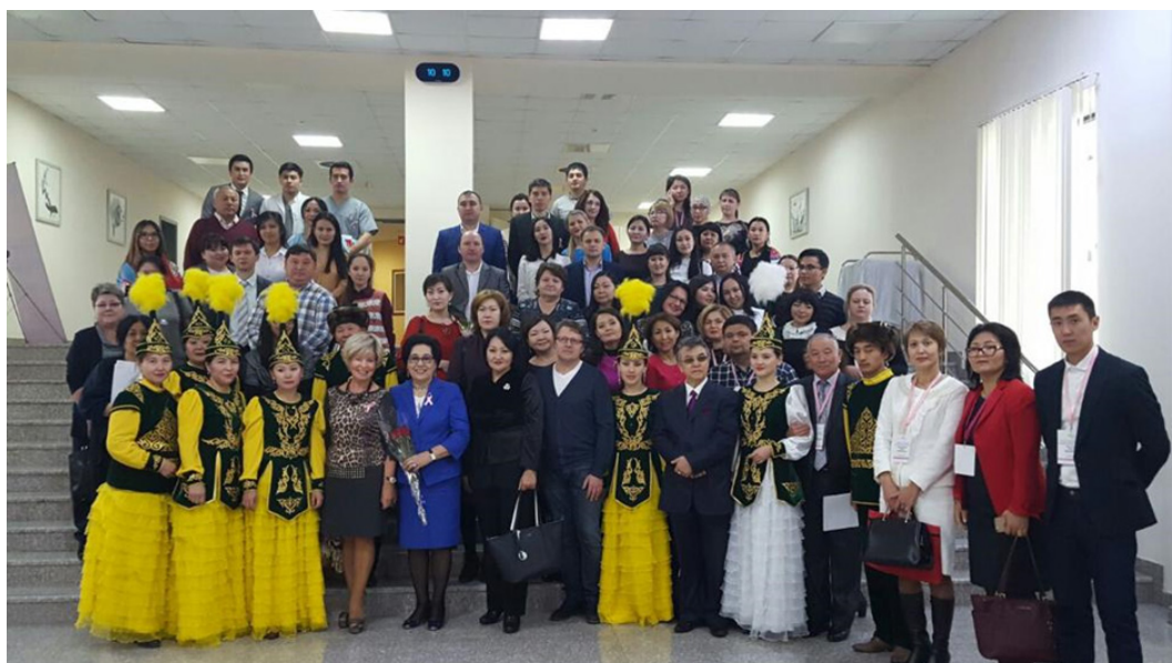
Figure 8. Eurasian Radiomammological School (2016 year, Astana).

In 2016, the first Eurasian school of breast imaging was organized by the initiative of the Radiological Society of Kazakhstan by inviting lecturers from Canada, Russia, Uzbekistan and Dagestan (Figure 8).