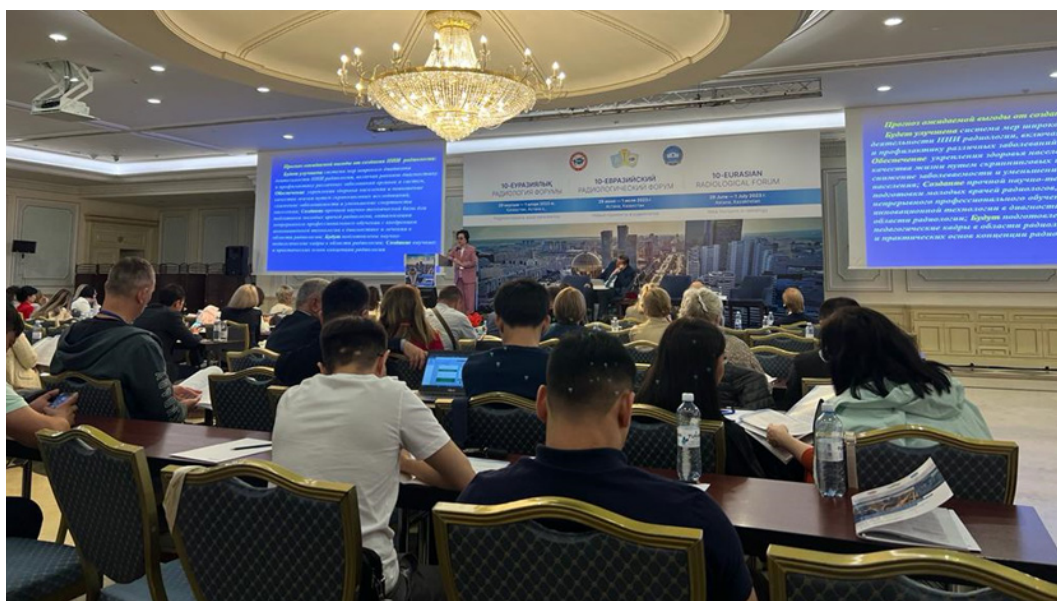
Figure 9. Participants of the first plenary session.

During June 29 - July 1, 2023, the 10th Eurasian Radiological Forum (10 th EARF) was held in Astana, Kazakhstan, by the Radiological Society of Kazakhstan (RSK) in an in-person format (Figure 9). The program consisted of the Friendship Symposium on cardiovascular radiology between the Korean Society of Radiology and the Radiological Society of Kazakhstan, a sectional session of the World Federation of Emergency Radiology, a sectional session of the Asian-Oceanian School of Radiology on pediatric radiology, a meeting between RSK and Russian Society of Roentgen Radiologists, and a joint meeting with the IAEA “Quality and safety in diagnostic and interventional radiology. About 400 attendees from 34 countries around the world with 86 overseas participants and 314 local participants participated in the 10 th EARF. The countries with the highest number of participants included Kazakhstan, Russia, Uzbekistan, and Belarus, respectively (Table 1).