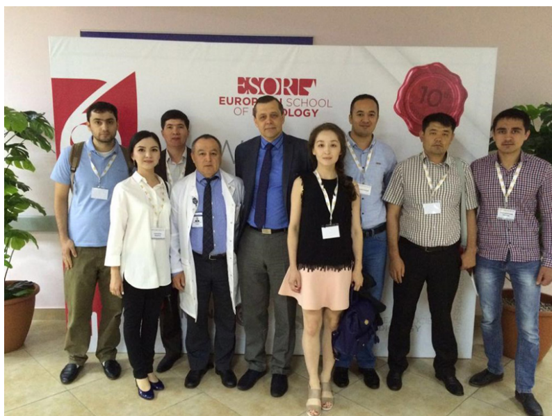
Figure 7. Third ESOR Astana Tutorial (2016 year, Astana).

In 2016, the first Eurasian school of breast imaging was organized by the initiative of the Radiological Society of Kazakhstan by inviting lecturers from Canada, Russia, Uzbekistan and Dagestan (Figure 8).