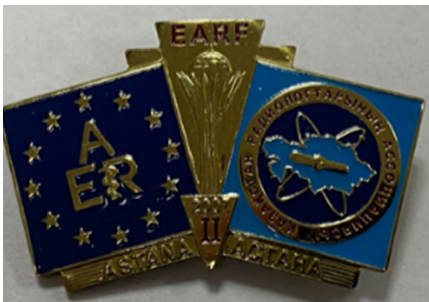
Figure 5. Emblem of the Second EARF.

In 2005, the Radiological Society of Kazakhstan established a biannual Eurasian Radiological Forum for educational purposes in close collaboration with radiological societies from Europe and Asia (Figure 5).