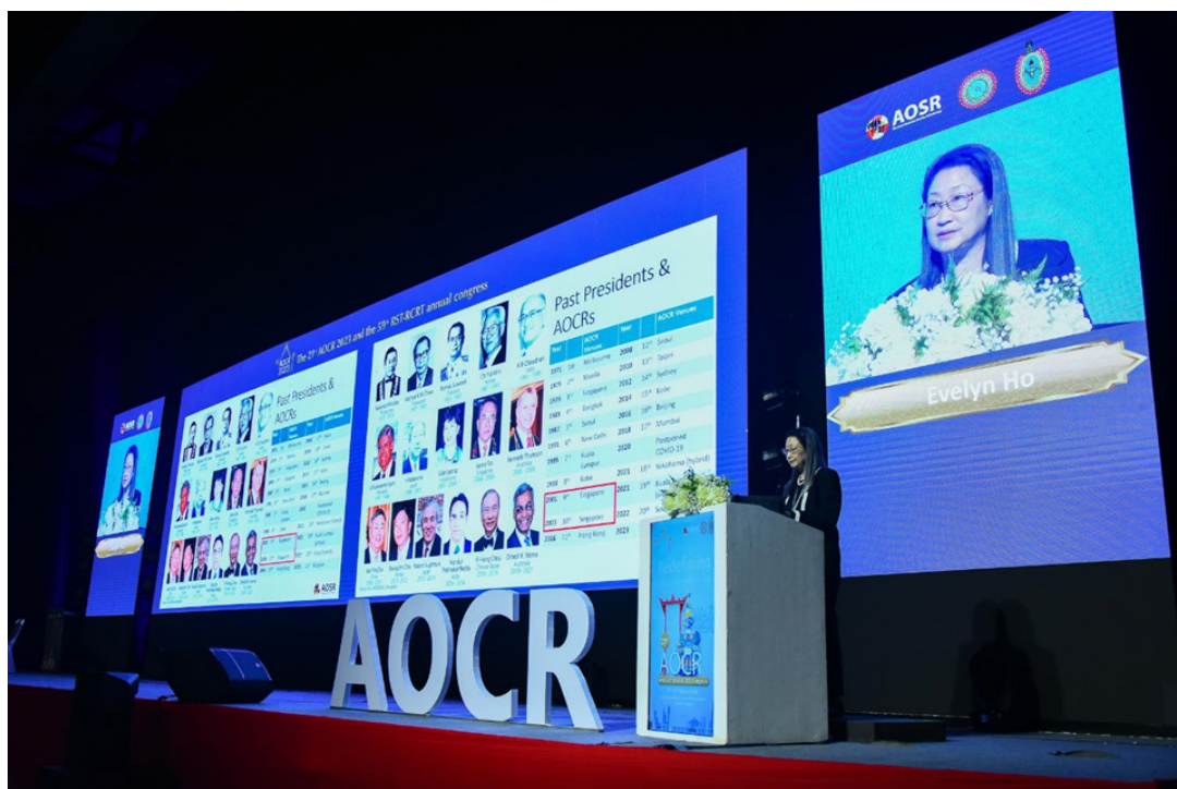
AOCR2023 Binbakya Bidyabhed Lecture on “AOSR: Past, Present, Future” by the author as the president of AOSR.

Oceanian Society of Radiology despite the Coronavirus disease (COVID-19) pandemic, testifying to the fact that collectively our allied professions are “Redefining the Possibilities in Medical Imaging” – in the way we make scientific exchanges, collaborate, train, teach and conduct research. In fact, close to this AOCR, there was a threat of COVID-19 surge that fortunately did not pose any issues for the on-site attendees.