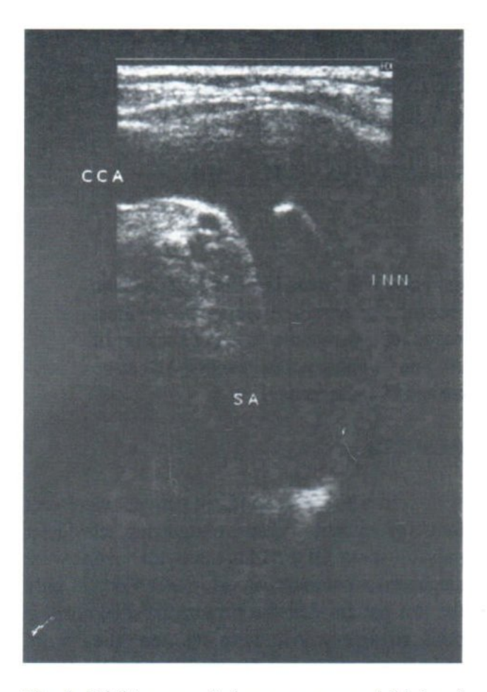
Fig. 1 Right parasagittal sonogram reveals high and superficial position of the buckling innominate artery (INN) corresponding to the supraclavicular pulsatile mass. CCA= common carotid artery, SA= subclavian artery