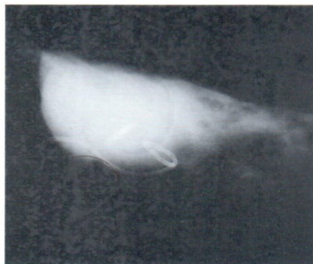
Fig.8. A lateral radiograph demonstrates the position of the catheter.

A 28-year-old man had peptic ulcer perforation and underwent surgery. He had postoperative fever, left lower quadrant pain and high leukocytosis. Sonography revealed an abscess in the pouch of Douglas and a separate smaller one next to it. The abscess in the pouch of Douglas was drained by a catheter inserted with the transrectal approach, and 50 cc of pus was aspirated. The catheter was removed 5 days after insertion. The smaller abscess was subsequently aspirated percutaneously.