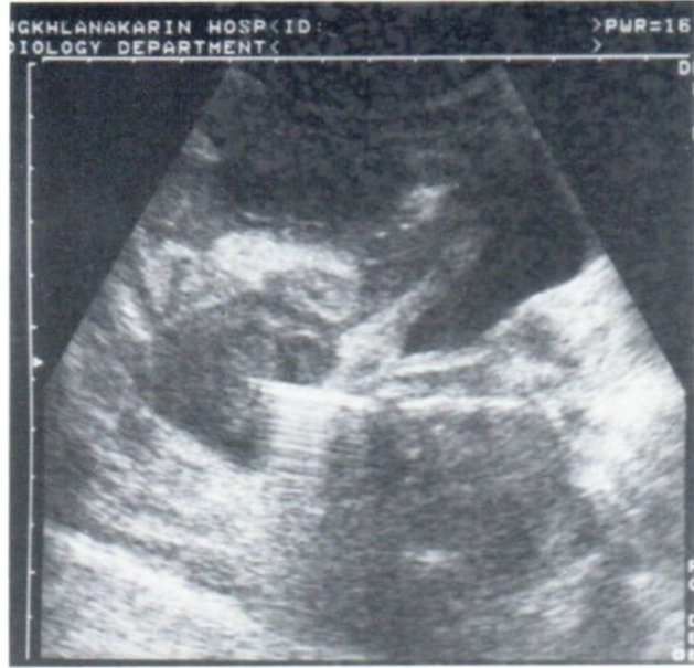
Fig.4. A sagittal sonogram showing that the abscess is punctured.