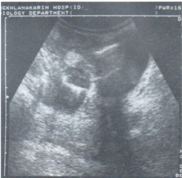
Fig.5. A sagittal sonogram shows that the abscess is partially collapsed after aspiration. The guide wire is placed into the abscess.