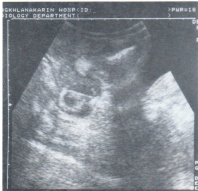
Fig.6. A sagittal sonogram shows placement of a self-retaining catheter.