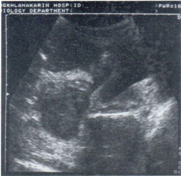
Fig.3. A sagittal sonogram shows a needle inserted via the rectum. The tip of the needle is in optimal contact with the abscess.