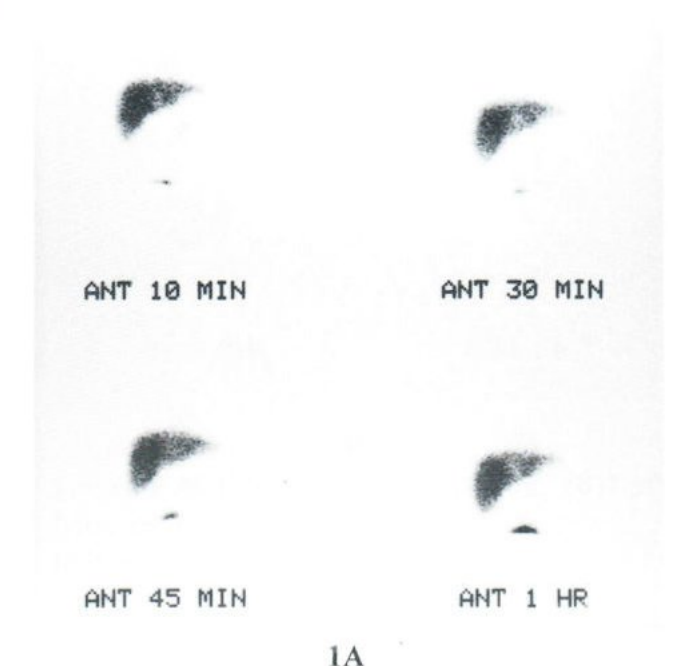
Fig.1(A) Biliary atresia. A 2-month-old infant presented with persistent conjugated hyperbilirubinemia and acholic stools. The Tc-99m DISIDA hepatobiliary scintigraphy reveals prompt hepatic uptake with no evidence of tracer excretion into the biliary and/or GI tract up to 6 hours after injection. The 24 hour image (not shown) also fails to demonstrate the GI activity. The patient had a final diagnosis as BA proven by surgery.

In our study, we found that the sensitivity, specificity and accuracy of Tc-99m DISIDA scintigraphy for the diagnosis of BA were 100%, 86% and 92%, respectively. The positive and negative predictive value were 85% and 100%.