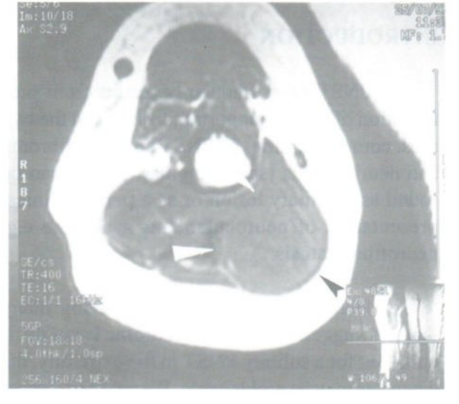
Fig. 1 B: T1-weighted axial MR image reveals the mass to be slightly inhomogeneously isosignal to surrounding muscles (arrowheads).

Fig. 1 A : T2-weighted sagittal MR image shows inhomogeneously hypersignal teardrop-shape mass (arrowheads). Inferior tapering of the mass indicates extension along longitudinally oriented structures.