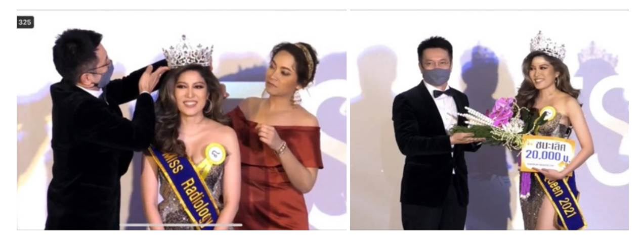
Miss Radiology Queen and the editor at the Gala of the TSRT annual meeting.

And then the second hybrid radiological conference was the annual meeting of the Thai Society of Radiological Technologists (TSRT), during 19-21 December 2021, in Bangkok. To prepare for the International Society of Radiographers and Radiological Technologists (ISRRT) Word Congress which will be held in Bangkok in 2022, TSRT selected its best society ambassadors, namely, Miss Radiology Queens, in its onsite gala dinner, apart from 3 full days of academic activities.